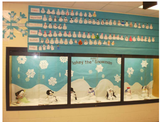
BELOW: A special display decorated the halls of their school in preparation of 'Flakey Day.'