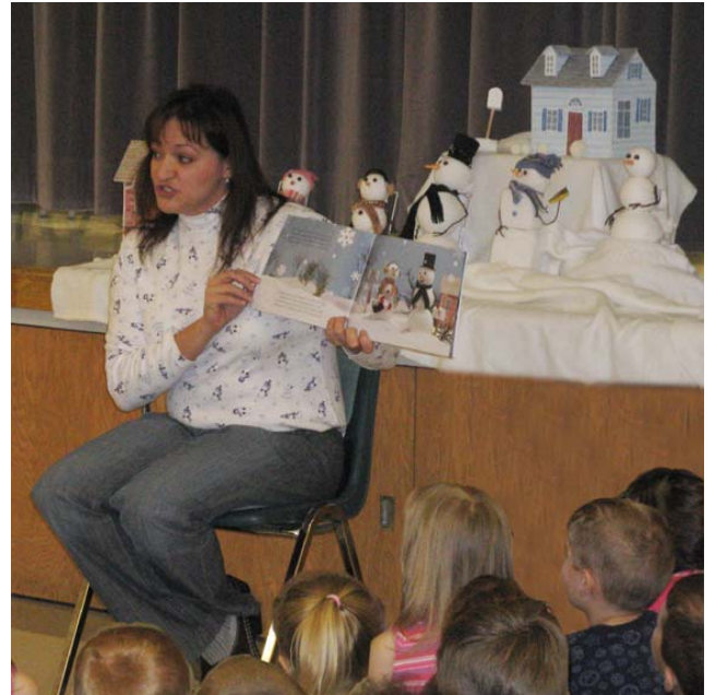
ABOVE: Readings were done assembly-style at Redbud Elementary in Frederick County, VA.